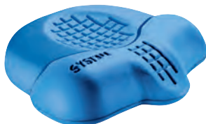
SYST'AM® P913L / OCCIPITAL SYSTEM